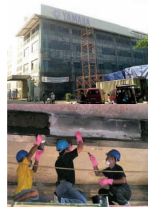
Tyfo ® Fibrwrap Applied to Fire Damaged Beams.

PT. Huls Tirtacitra, the Tyfo ® Certified Applicator in Indonesia completed work in the short span of fifteen days.