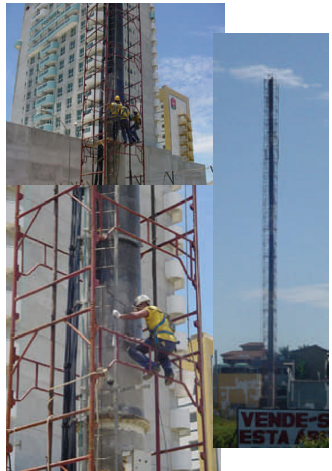
Cell Towers strengthened with Tyfo® Systems

The Tyfo® SCH-11UP Carbon System was used to provide additional strength in the moment regions as identified during the analysis. The Tyfo® WEB Bi-directional Glass System was used over the remaining surface to prevent crack propagation and provide additional protection against chloride infiltration.