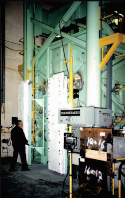
Fire Test Chamber

ASTM E-84 tested outer layer Class 1 test flame and smoke values 2 and 5 respectively.